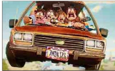
THE MITCHELLS VS. THE MACHINES (PG) 112mins ★★★

Director Mike Rianda's script, co-written with Jeff Rowe, is fresh, warm and funny, filled with smart observations on how