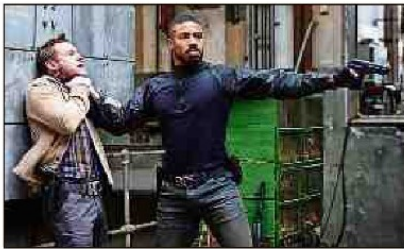
TOM CLANCY'S WITHOUT REMORSE (15) 108mins ★★★

Determined to take revenge on the assassins, he joins forces with fellow SEAL Karen Greer (Jodie Turner-Smith) and CIA agent Robert Ritter (Jamie Bell) only to find himself caught in the crossfire (literally) of a shadowy US-