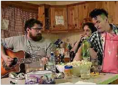
THE NEW MUSIC (15) 83mins

Despite his initial resistance, Adrian's new friends draw him out of his shell as he swaps his suit jacket for a leather bomber, comes to