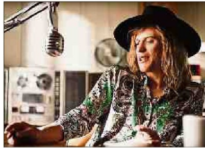
STARDUST (15) 109mins