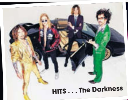
HITS . . . The Darkness