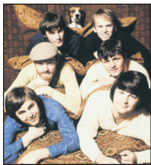
60s IDOLS... Beach Boys

Despite a career packed full of drug taking which was so extreme that it caused brain damage, he's still chomping at the bit to get back doing what he does best. Brian, 73, said: "I