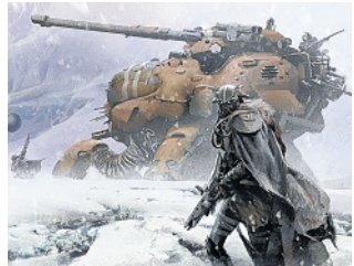
DESTINY Release date: September 9 PS3/PS4/Xbox 360/Xbox One

THIS has been on everyone's radar since its first announcement. From the creators of Halo and the publisher behind Call Of Duty, Destiny is a FPS built from the ground up to have you interacting with players all around the world. We were able to get our hands on this exciting title and, from what was shown, it's been worth the wait. Destiny brings exciting and varying gameplay, and it seems it's going to offer countless hours of fun. ● Read more about Destiny in The Scottish Sun on Sunday.