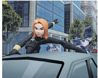
DISNEY INFINITY 2.0 Release date: September, 2014 Wii U/PS3/PS4/Xbox 360/Xbox One/PC/IOS

THE first Disney Infinity brought the world of Disney characters into our homes. Now the Marvel heroes come out to play. Kids can play as their favourite Marvel icon whenever and however they want. The Toybox mode has been expanded. When creating your own levels now, you can set the game to procedurally generate content, saving time if you want to explore something new. It might have won our Best For Kids award, but any fan of Marvel is going to fall in love with the detail of the characters and the beautifully crafted models.