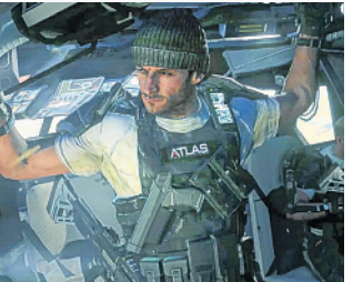
CALL OF DUTY: ADVANCED WARFARE Release date: November 4 PS3/PS4/Xbox 360/Xbox One/PC

ADVANCED Warfare obviously looks great, but CoD's key sell is the exaggerated, in-your-face, all-out warfare that its cult following so adores. Still, there's plenty of intricacies beyond the usual crash, bang, wallop style. The single player mode offers plenty of value, but who are we kidding? It's all about the multiplayer and Activision have really upped their game. Legions of loyal fans will buy the world's best-selling game regardless – and, unlike some of its precursors, Advanced Warfare will be befitting of that title.