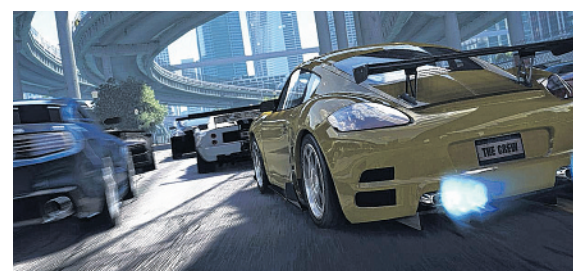
THE CREW PS4, Xbox One, Windows, July-September

Fast and a twist on a tired genre? An early favourite for game of the year.