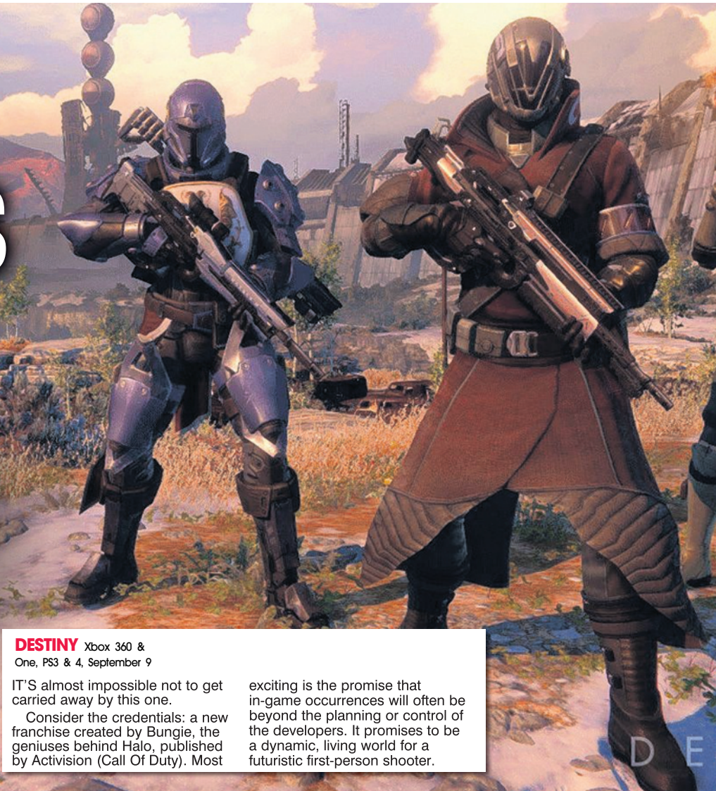
DESTINY Xbox 360 & One, PS3 & 4, September 9

Here, we look at five of the most exciting games for the year ahead.