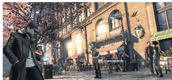
WATCH DOGS Xbox 360 & One, PS3 & 4, Wii U, April-June

exciting is the promise that in-game occurrences will often be beyond the planning or control of the developers. It promises to be a dynamic, living world for a futuristic first-person shooter.