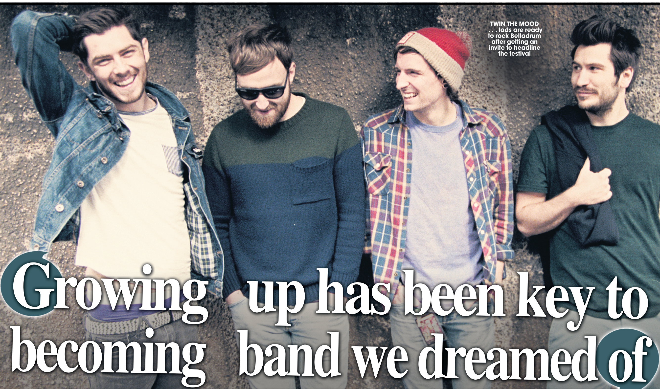
TWIN THE MOOD ... lads are ready to rock Belladrum after getting an invite to headline the festival